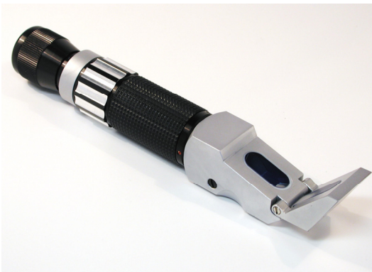
E-Line 80 Refractometer Illuminating Prism open