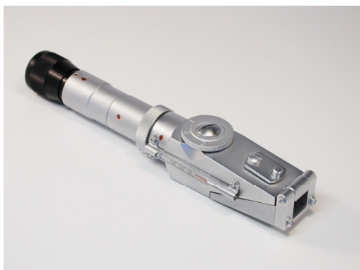
E-Line Refractometer under side