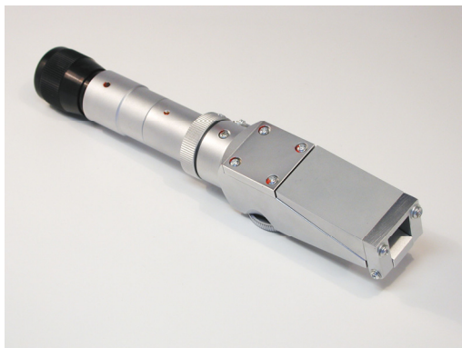
E-Line Refractometer top side